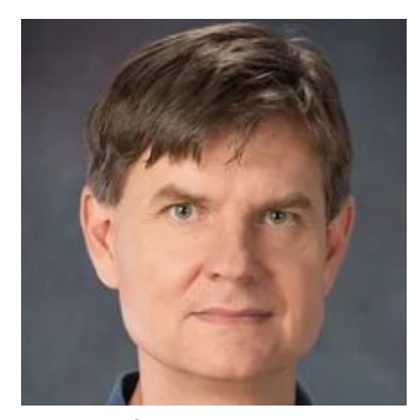
Martin Gilar Chromatographic methods for analysis of therapeutic oligonucleotides and mRNA