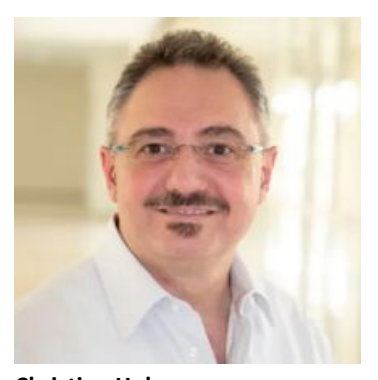
Christian Huber Structural analysis of highly complex protein therapeutics by HPLC-MS: lessons that we have learned from an analytical chemistry perspective